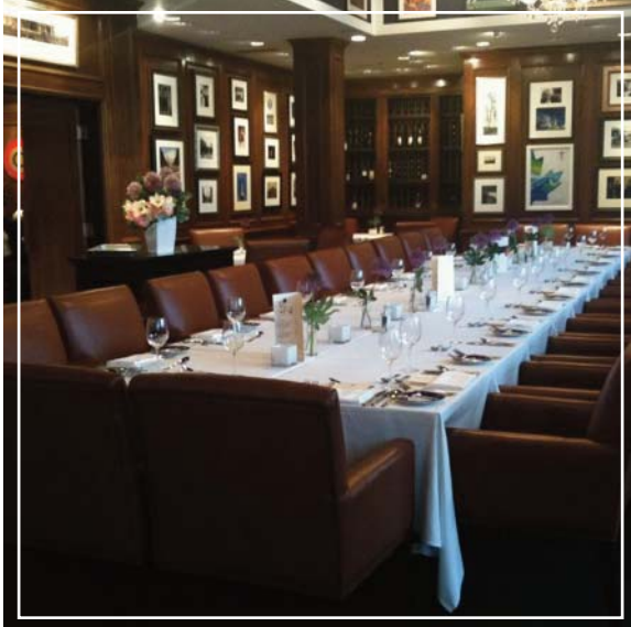
The Cambridge Club Classic Elegance