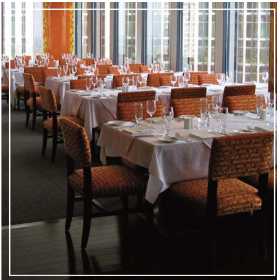
The Toronto Athletic Club The Club Above