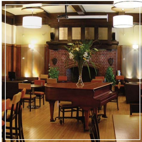
Club Sportif MAA Your Private Downtown Bistro